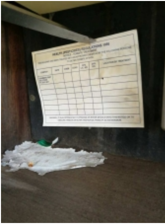
Chambers barrier 2015