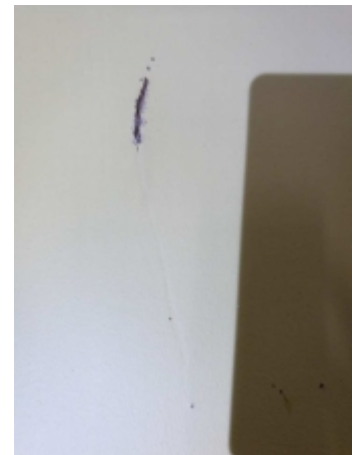
Stumps near letterbox, Laundry walls and above roof, timber floorboards near laundry, wall to living area above air conditioner, wall other side of bathroom, timber pier subfloor near bathroom, loose timber lhs of house